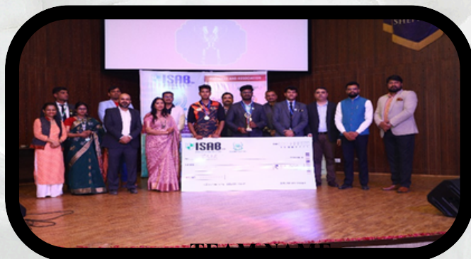
Table Tennis Tournament